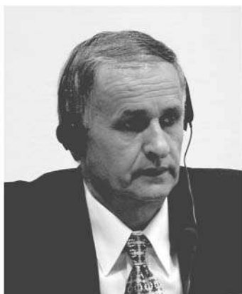
4. Radislav Krstic: Commander of the Drina Corps, a formation of the Bosnian Serb Army, and, later, facing charges of genocide

try individuals for three types of international crimes: genocide, crimes against humanity, and war crimes.