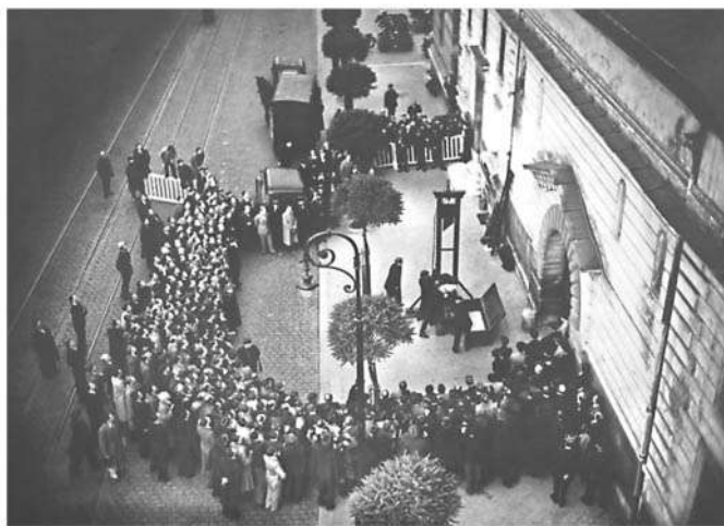
The death penalty

16. A lethal injection chamber in the US today, and the last public execution in France, which took place in 1937 in Versailles by guillotine. The guillotine was introduced in France as a humane method of execution in 1792 and was used until 1977