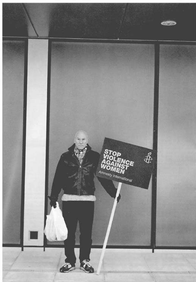
15. Amnesty International's high-profile campaign, supported here by Patrick Stewart, encourages people to speak out against domestic violence as a human rights issue