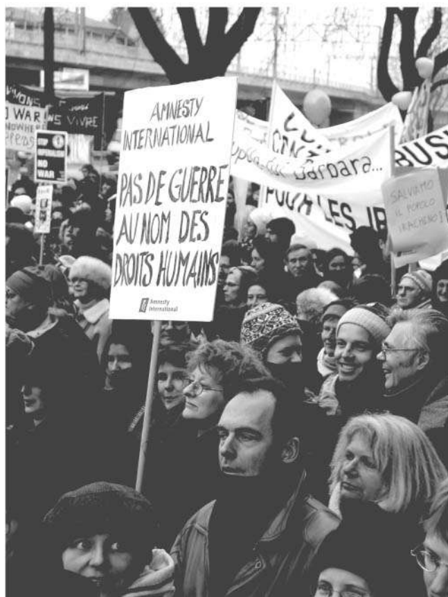
6. 'No war in the name of human rights': A demonstration in Bern (Switzerland) against the 2003 Iraq war