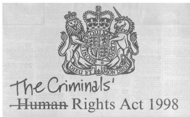
1. Headline from The Sunday Telegraph , 14 May 2006: branding the Human Rights Act 'the refuge of terrorists and scoundrels'